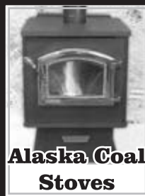
Alaska Coal Stoves