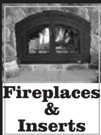
Fireplaces & Inserts