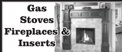
Gas Stoves Fireplaces & Inserts

45 Stoves & Furnaces on Display 21 Burning Floor Models SEE 'EM BURN!